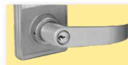
Regal handle option

Deadbolt Models: Feature stainless steel deadbolt with 1" (2.55cm) projection, latchbolt with 3/4" (1.91cm) projection and deadlocking latch. Deadbolt may be projected from key cylinder from outside door or turn-piece from inside door.